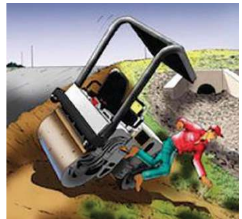
Safest rolling solution on the market!