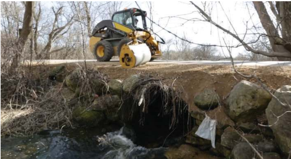
Offset feature allows operator to stay on the road while rolling and compacting shoulders and ditches.