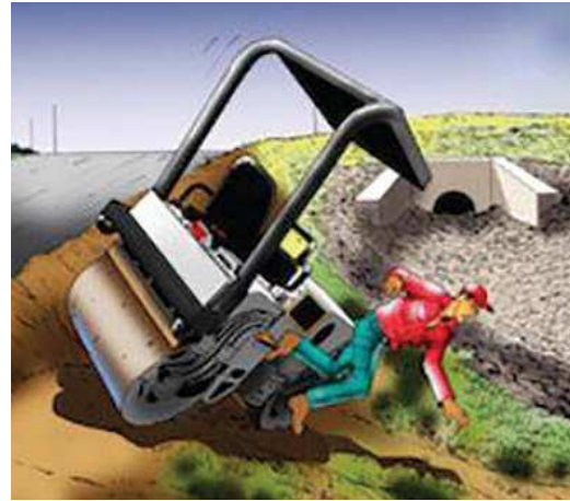
Safest rolling solution on the market!