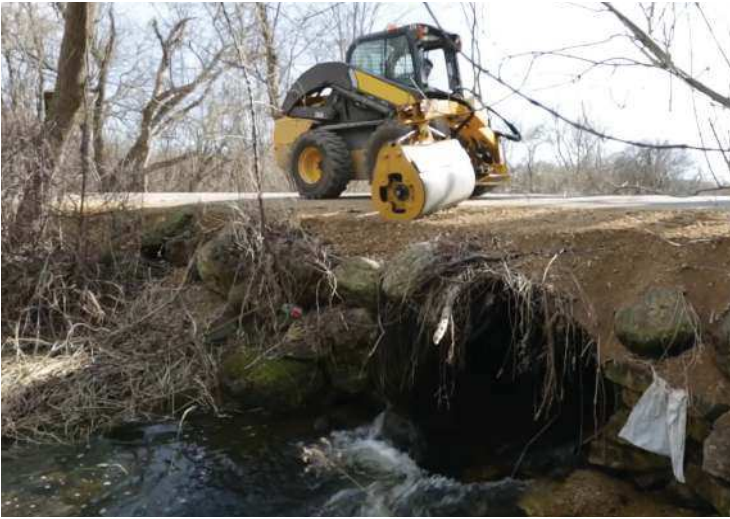
Offset feature allows operator to stay on the road while rolling and compacting shoulders and ditches.